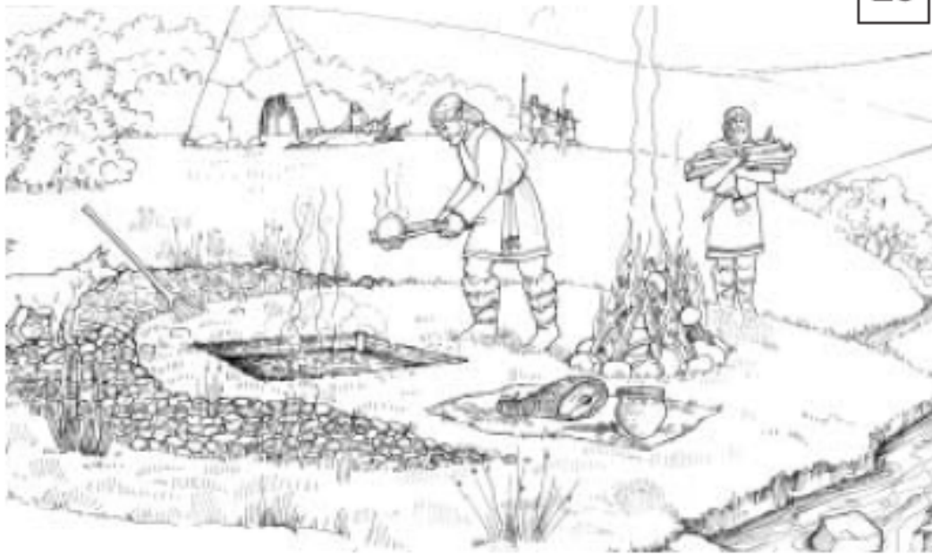
This is a Bronze Age cooking place called a fulacht fia. Hot stones are used to boil water. Meat was then cooked in the hot water.