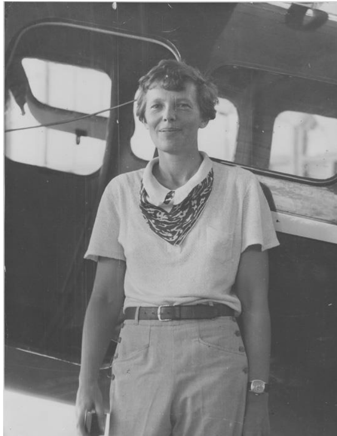
Amelia Earhart by San Diego Air & Space Museum Archives (2010)

https://www.flickr.com/photos/sdasmarchives/4728433769/