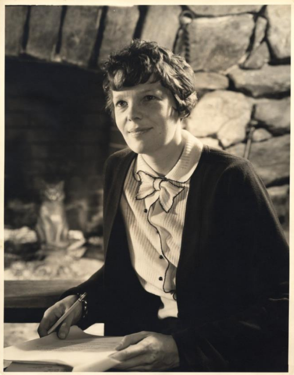
Amelia Earhart