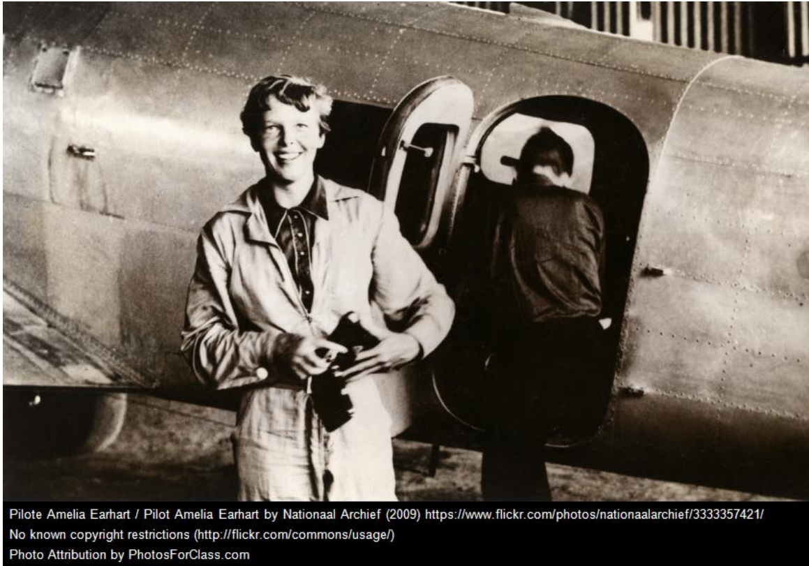
Pilote Amelia Earhart / Pilot Amelia Earhart