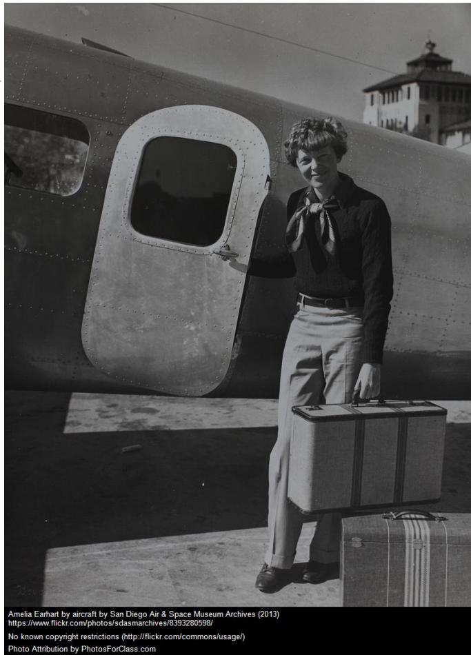
Amelia Earhart by aircraft