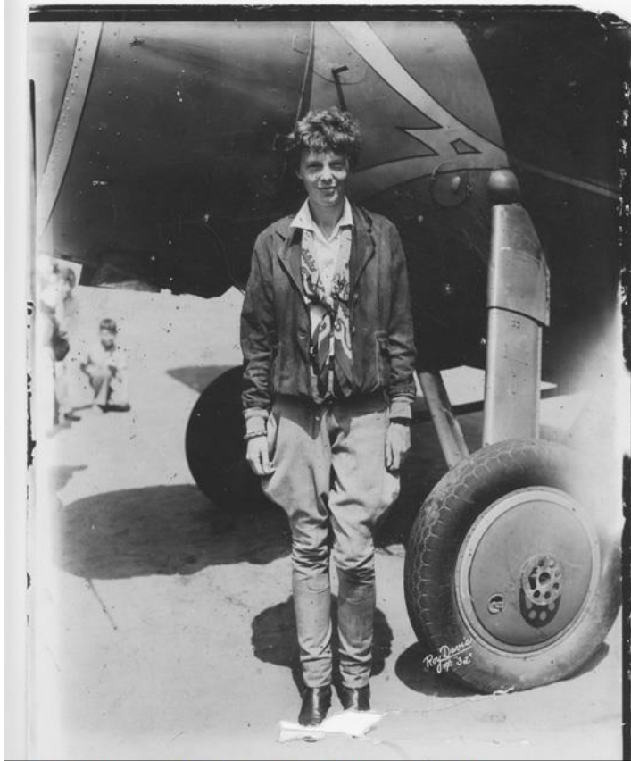
Earhart, Amelia