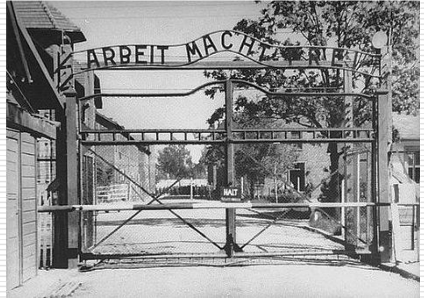
The entrance to the Auschwitz-Birkenau work camp