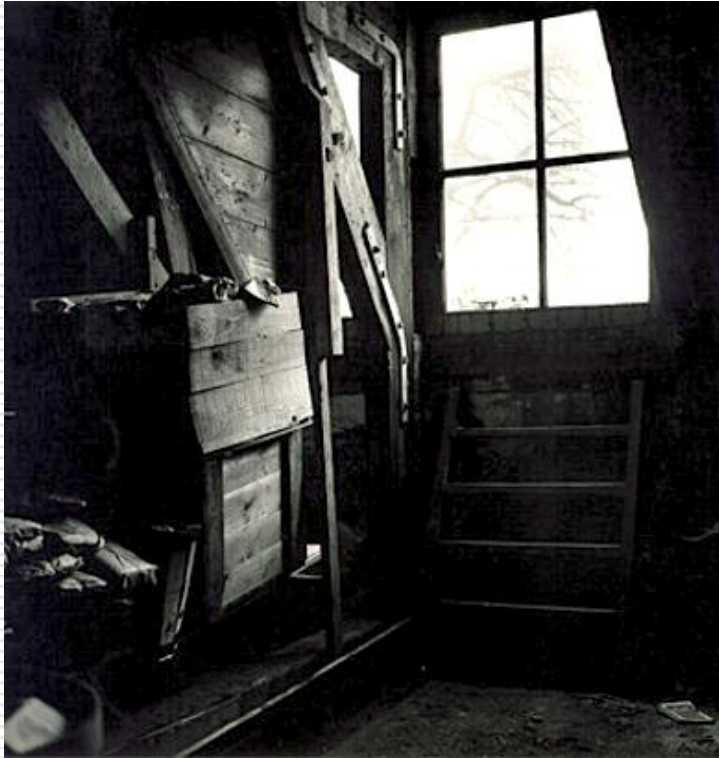
Anne's attic window