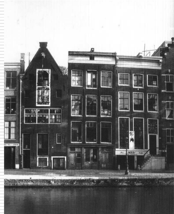
The house where the Frank family hid